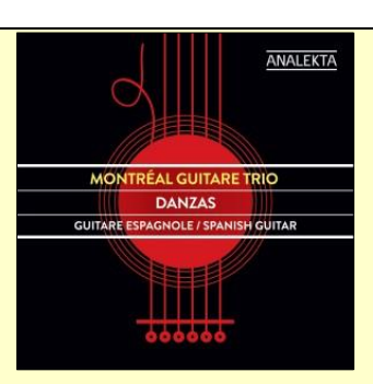
"Danzas," music for Spanish guitar, incl. Falla: Dance of Fire - Montréal Guitare Trio (Analekta)

An ambitious project, to be sure. Consider the sheer vocal demands. From the painful intensity of Das Trinklied von Jammer der Erde (Drinking Song of the Earth's Sorrow) and the vaulting spirits of a gallant youth galloping on a lusty steed in Von der Schönheit (Of Beauty) all the way to the word ewig (forever), repeated like a mantra to the very limit of audibility as the light fades into the blue distance in Der Abschied (The Farewell), Mahler's dynamic requiremens for the voice are extreme. One could hardly expect to be able to repeat this sixsongs-in-one-voice feat night after night, much less be able to take it on tour. In that respect, I note that Kaufman and the VPO under Joanathan Nott took their time with the recording sessions over the week of June 16-22, 2016, getting every nuance and detail just right.