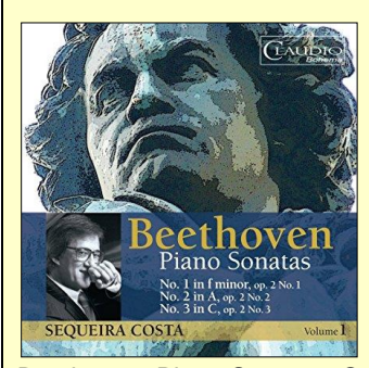
Beethoven: Piano Sonatas, Op. 2, Nos 1-3 Sequeira Costa, piano (Claudio)

Tempered Clavier, concluding with a personal account of the Prelude and Fugue in D minor, BWV 875 that shows how today's young keyboard artists are disposed to take WTC as "real" music, not just academic theory.