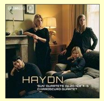
Haydn:"Sun" Quartets, Op. 20, Nos. 4-6 Chiaroscuro String Quartet (Bis Records)

in many parts of the world. The melodies in both works are strikingly beautiful, even by this composer's standard, and his accompaniments are masterfully varied, from the undulating rhythms underlying the nostalgic themes throughout the Lento of the Quartet to the stirring tremolando underscoring the fourth variation in the Larghetto of the Quintet<sup>i</sup>. In both works, the melodies are there in abundance, but, as we said earlier, don't neglect the importance of the settings!