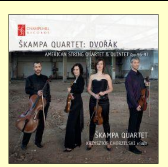
Dvořák: "American" Quartet, Op. 96 + String Quintet, Op. 97- Škampa String Quartet (Champs Hill)