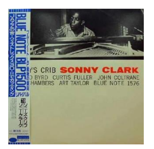
Sonny Clark – Sonny's Crib Blue Note

On Green Dolphin Street, Love For Sale – Source: JazzStandards.com